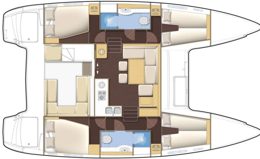
4 cabines 2 SDB / 4 cabin 2 bathrooms