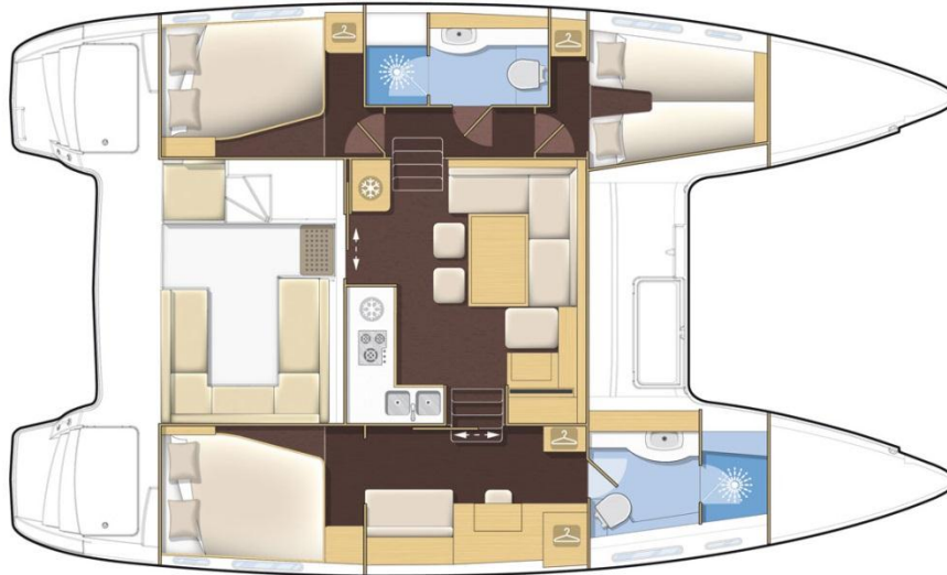
3 cabines 2 SDB / 3 cabin 2 bathrooms