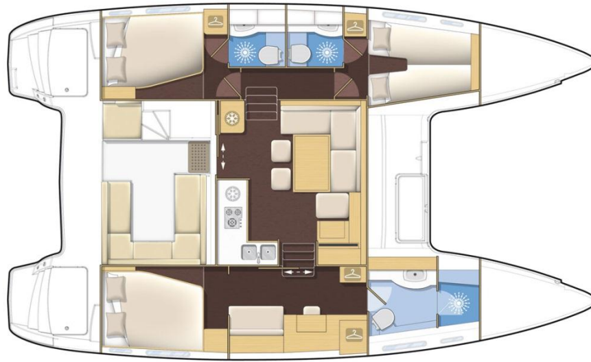
3 cabines 3 SDB / 3 cabin 3 bathrooms